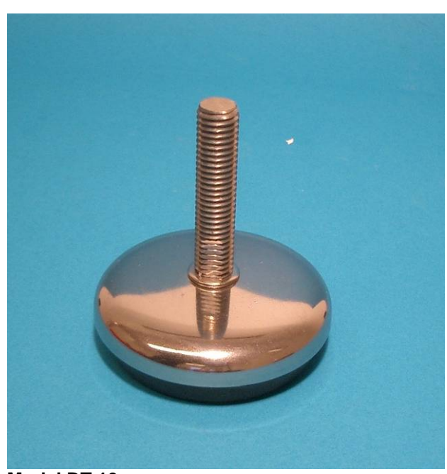
Model DT 10